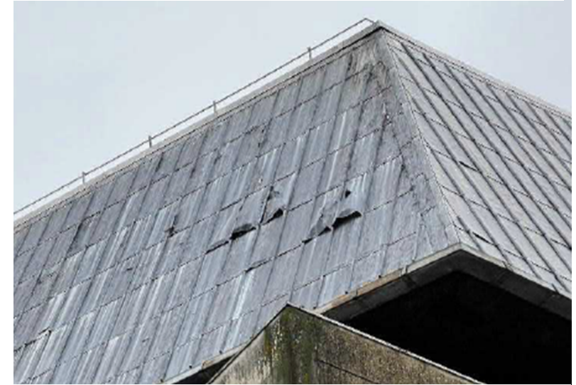
Lead faced Mansard Vertical Roof