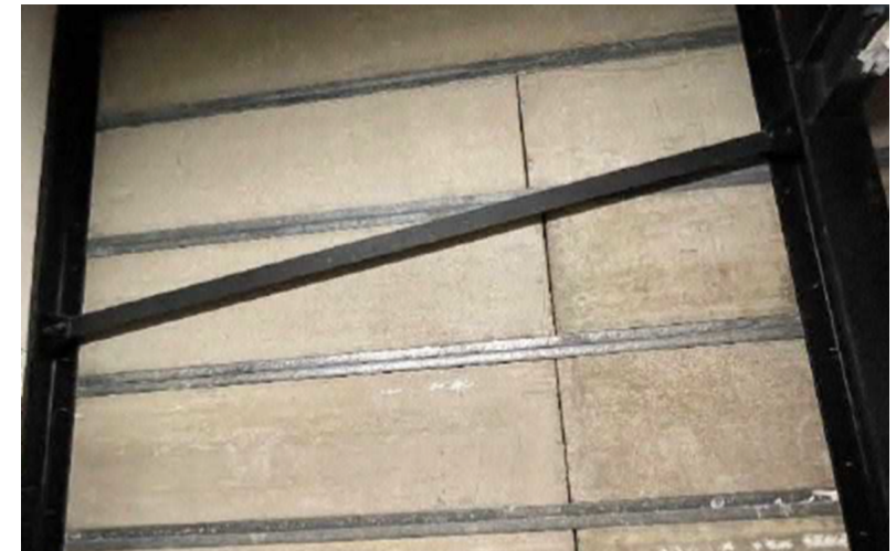
Woodwall Slabs (Mansard Roof).