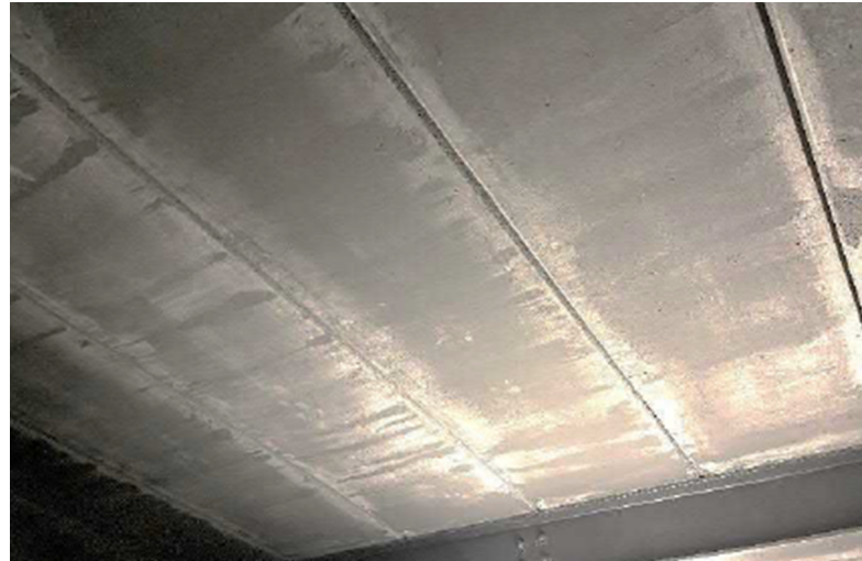
RAAC Planks to underside of Roof